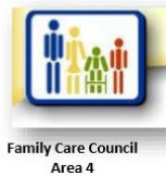
Family Care Council Area 4